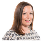
Vikki Howells AM Welsh Labour Cynon Valley