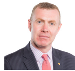
Adam Price AM Plaid Cymru Carmarthen East and Dinefwr