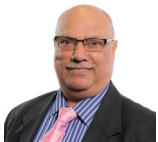
Mohammad Asghar AM Welsh Conservatives South Wales East