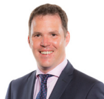
Lee Waters AM Welsh Labour Llanelli