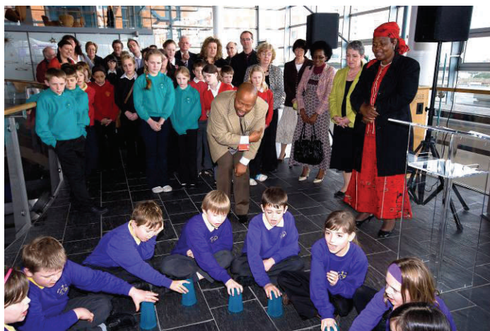
Children from Ysgol Pencae perform an action song from Lesotho.